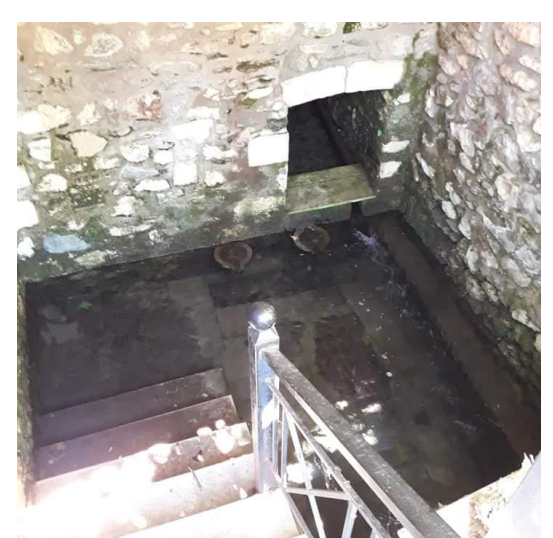
The Panaghia spring overflowed

August is, admittedly, a month with frequent rain showers, which we have gotten used to. Therefore, we were not surprised by the several rain showers, especially during the afternoon hours, throughout the month. As a result, the water level in the water reservoirs, which had been alarmingly low in early July, rose and there were even times of overflow. The pictures depict the beautiful, green landscape.