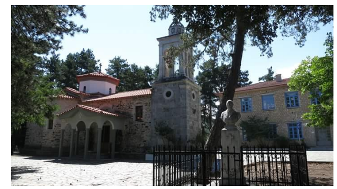
The St. Paraskevi church