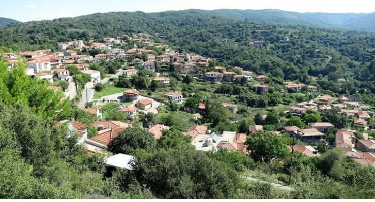
View of Vergatsoula and Koutsomachalas