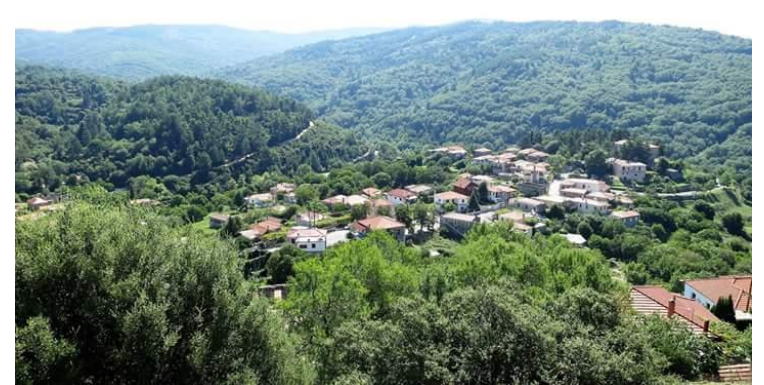
View of Rachi