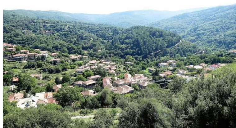
View of Rachi and Koytsomachalas