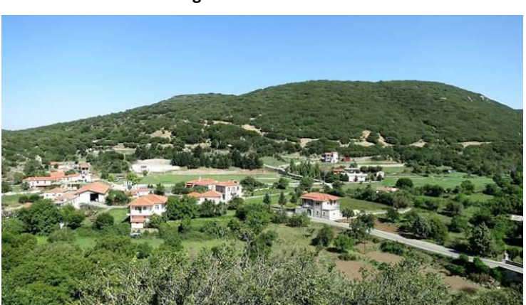
View of Pinighoura

Nature, scientists say, always has a way to find its balance. Based on this theory, after a mild winter and a dry spring, the summer of 2018 was characterized by unprecedented rainfalls across Greece. In July, for the first time in decades, the rains were not only numerous but also intense. More specifically, a rather small heat wave between July 20th and 24th was followed by a five-day rainy period which lasted from July 25th until 30th, where we counted a total of more than ten rainstorms! Excluding the day of the festival, July 27th, when it rained twice in the afternoon only, all the other days, storms began early before noon time and lasted until late in the afternoon. There was also a hail-storm, luckily not destructive, on the day of the celebration of Aghia Paraskevi, July 26<sup>th</sup>, at noon, and a terrifying storm on Sunday, July 29<sup>th</sup>, in the afternoon. It is very important to mention that the waters of Deiros river (Panagia's river), which had been dry since Easter time, rose dangerously and the flow was such that the road to the village of Aghios Petros became very dangerous for a while.