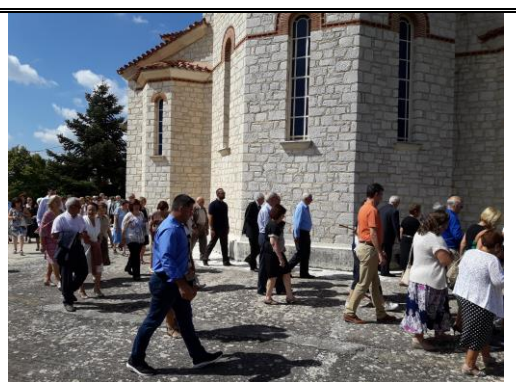
August 15: The Assumption of Holy Mary