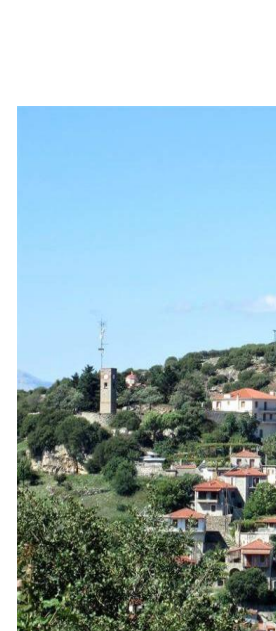
View of Aghios Ioannis