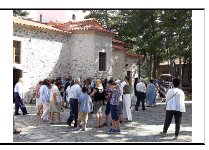
July 27: Saint Panteleimon